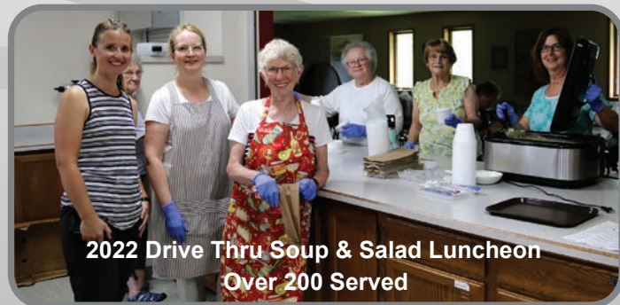
2022 Drive Thru Soup & Salad Luncheon Over 200 Served