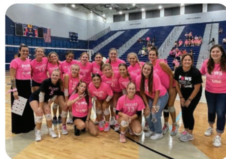
SUN PRAIRIE WEST